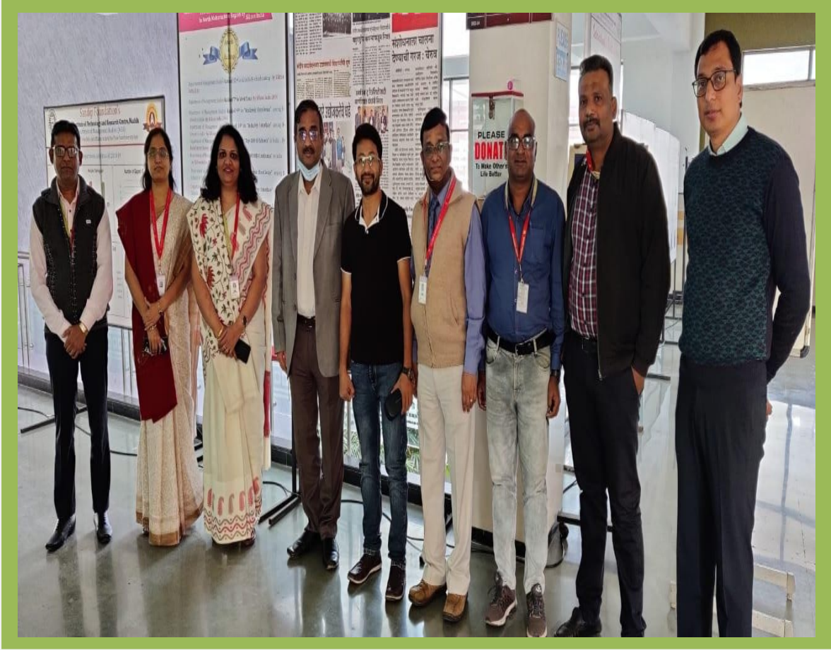
Guest lecture on, “Skills required to work abroad”