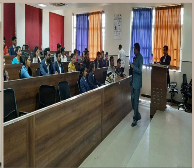
From the Page of Management Guru: Source ( www.azquotes.com )